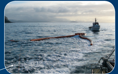
Norwegian Coastal Administration