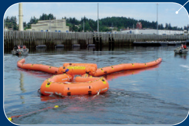
US NAVY / US Coast Guard (USA)