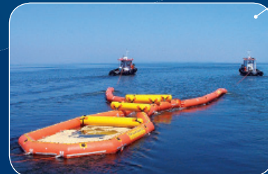
Petrobras / Transpetro (Brazil)