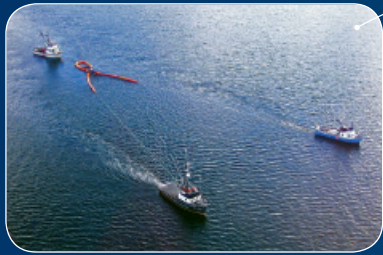
Servs (Alaska, USA)