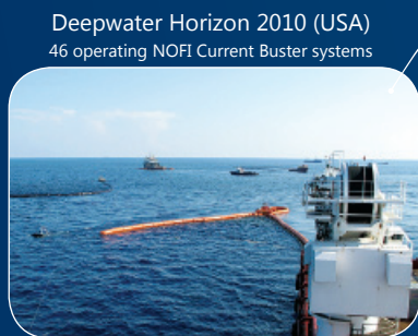
Deepwater Horizon 2010 (USA) 46 operating NOFI Current Buster systems