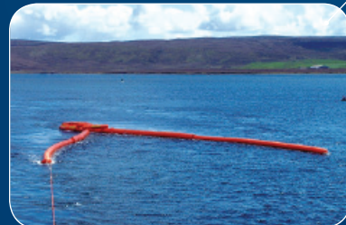
British Petroleum (Shetland)