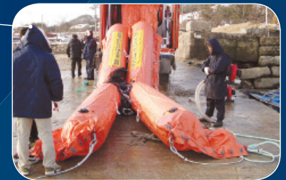
Korea Marine Pollution Response Corp. (South Korea)