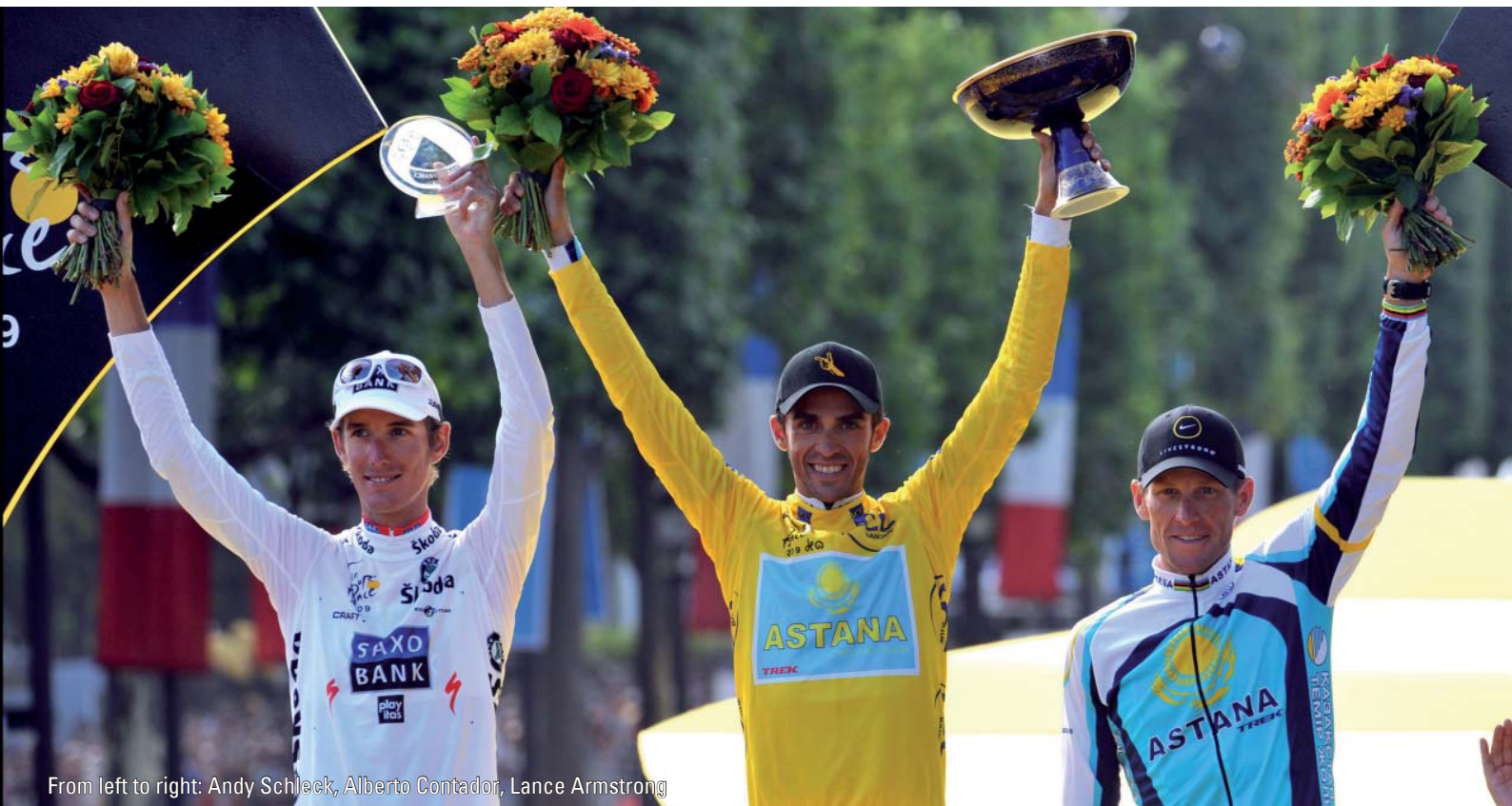
From left to right: Andy Schleck, Alberto Contador, Lance Armstrong

SRAM RED takes 1 st , 2 nd and 3 rd place at the 2009 Tour de France