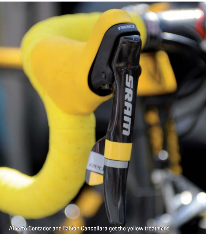
Alberto Contador and Fabian Cancellara get the yellow treatment

Special SRAM RED groupsets make their appearance at the 2009 Tour de France